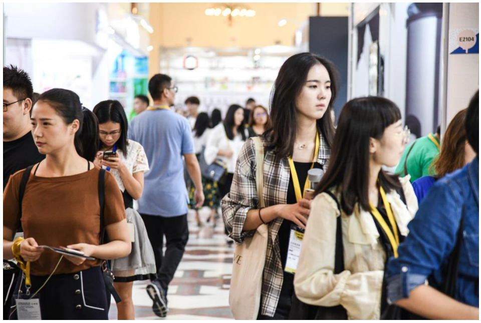
Millennial visitors at Interior Lifestyle China 2018

The concept of a status symbol has long driven Chinese consumer power in many markets. Expensive items such as designer apparel and cars are clear external and social indicators of financial success. However, one major generation of Chinese consumers, millennials, now looks inwards to the home, in order to express their identity and lifestyle through thoughtful interior design. Midrange to high-end exhibitors from around the world are preparing to access these opportunities at Interior Lifestyle China 2019, to be held from 11 – 13 September 2019 in Shanghai.